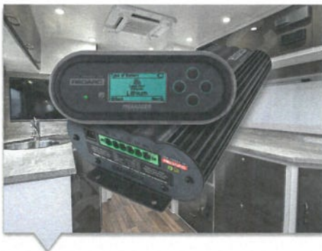
REDARC 30AMP BMS

If you are planning on travelling the country in your RV, you want to be as prepared as possible for muddy tracks, steep roads and long hauls across the country's main highways.