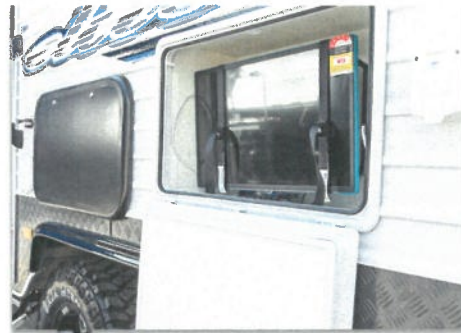
24" EXTERNAL TV