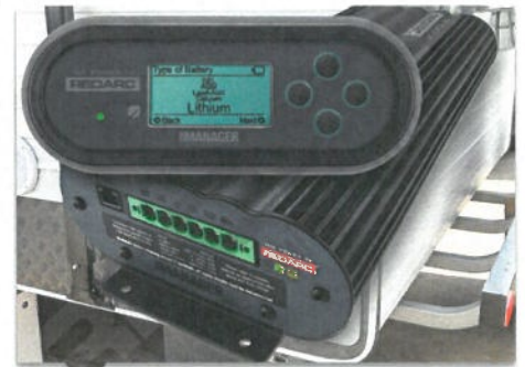
REDARC 30 AMP BATTERY MANAGEMENT SYSTEM

FULL OFF-ROAD WARRANTY ANY SURFACE IN AUS - NO EXCLUSIONS