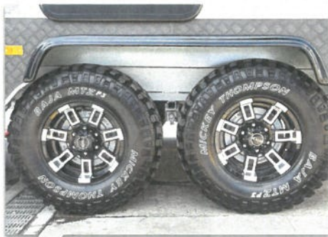
4.1T CRUISEMASTER COIL XT SUSPENSION

It's spacious enough to relax in. There's room to 'live' rather than sit. A bedroom that's retreat not just a berth, and an ensuite that's a room, not a compartment. It has a kitchen that can fit a week's worth of groceries, a fridge and freezer that can handle left-overs. It's a caravan that feels like a 'home'.