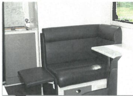
CAFE LOUNGE WITH FOOTRESTS