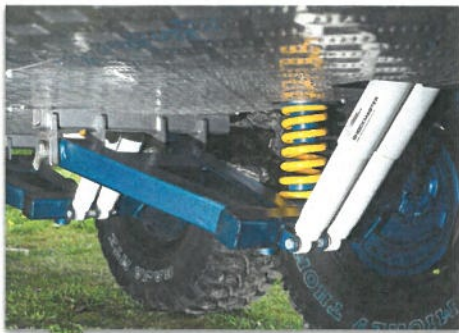
3.7T CRUISEMASTER SUSPENSION

The Goulburn 18'10" comes with a 3.7T Coil XT Cruisemaster Suspension, 16" alloys, checkerplate protection and the latest Redarc battery management system.