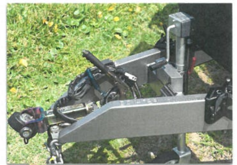
D035 HITCHMASTER COUPLING

FULL OFF-ROAD WARRANTY ANY SURFACE IN AUS - NO EXCLUSIONS